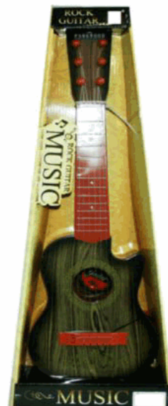
Packaged size 60 x 22 x 8 cm