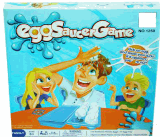
Packaged size 27 x 27 x 5 cm