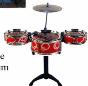
Packaged size 33 x 20 x 12 cm