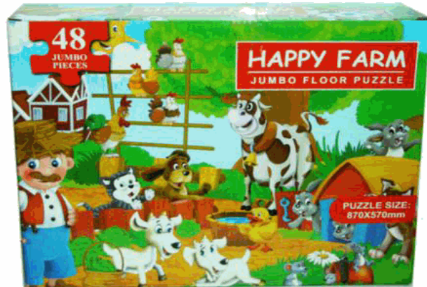
Packaged size 30 x 23 x 9 cm