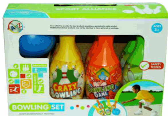
Packaged size 28 x 21 x 15 cm