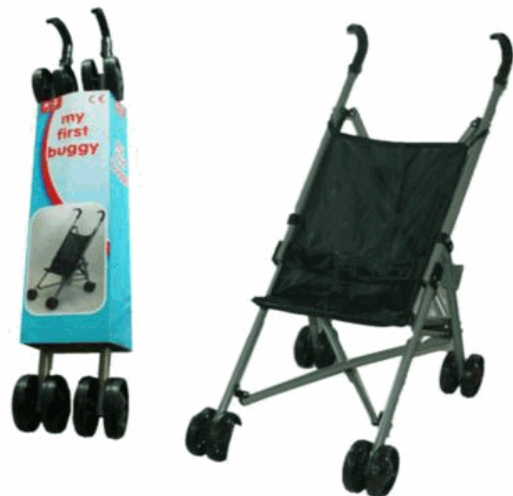
Packaged size 60 x 10 x 12 cm