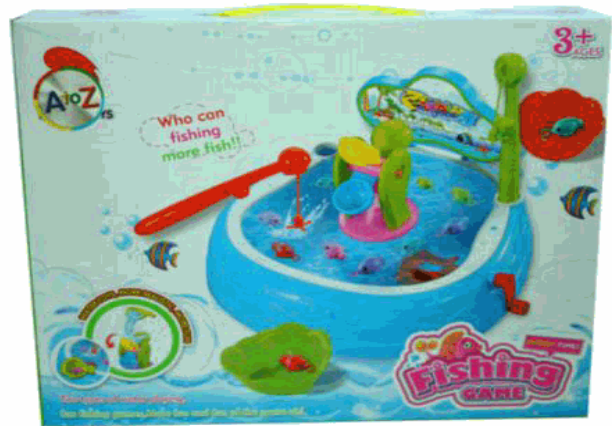
Packaged size 34 x 27 x 6 cm