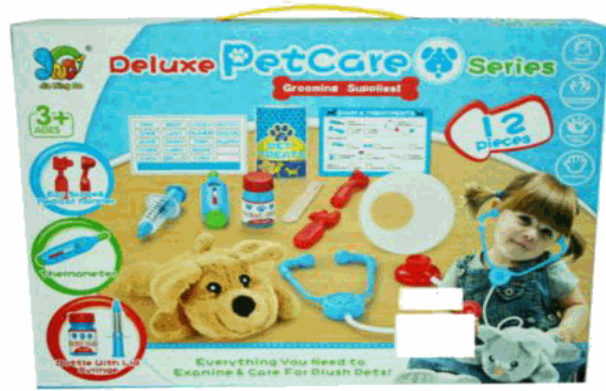
Packaged size 35 x 26 x 6 cm