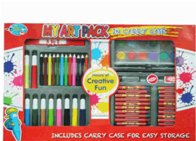
Packaged size 47 x 32 x 3 cm