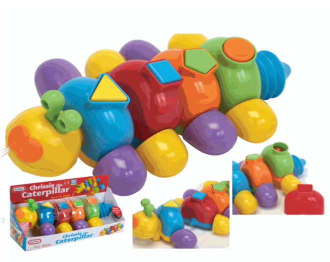
Suitable for ages 12 Months & up Packaged size 30 x 17 x 14 cm