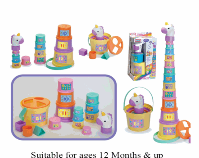
Suitable for ages 12 Months & up Packaged size 15 x 32 x 15 cm