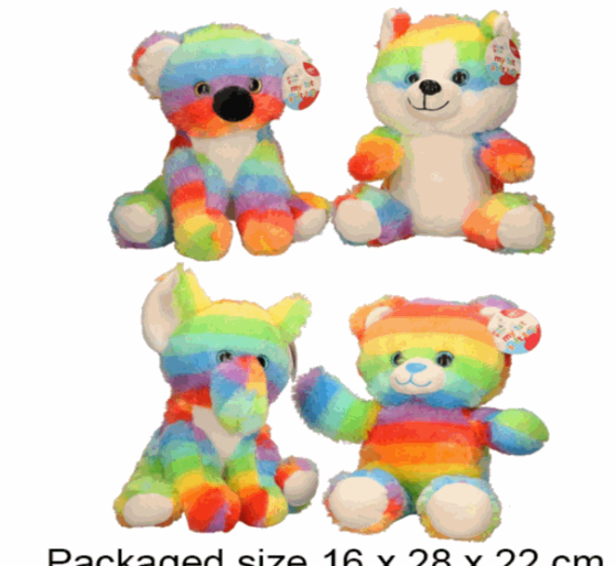
Packaged size 16 x 28 x 22 cm Suitable for ages 10 Months & up