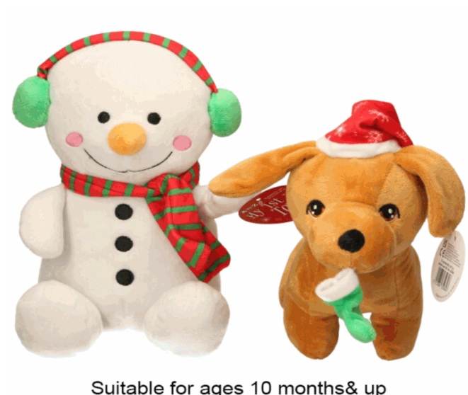
Suitable for ages 10 months& up Packaged size 16 x 23 x 13 cm