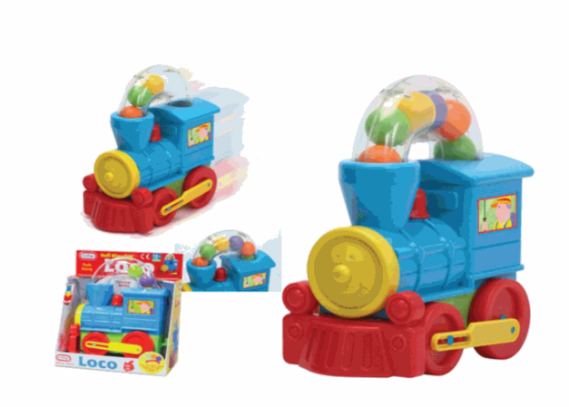
Suitable for ages 12 months & up Packaged size 24 x 26 x 12 cm