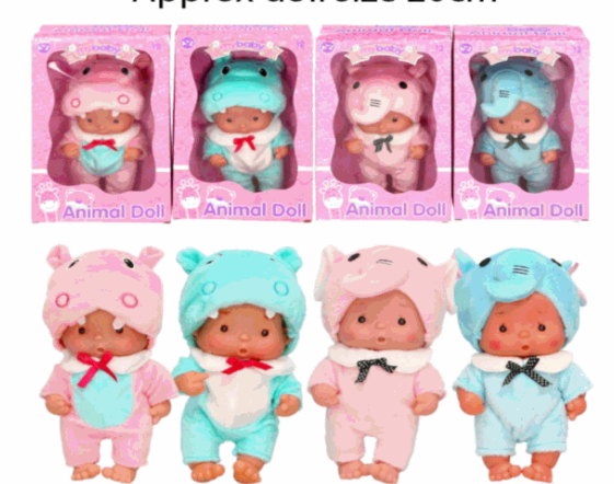
Packaged size 16 x 25 x 10cm Suitable for ages 12 Months & up