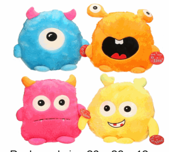
Packaged size 26 x 28 x 12 cm Suitable for ages 10 Months & up