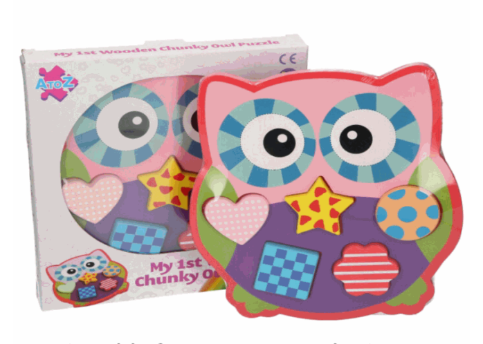
Suitable for ages 12 months & up Packaged size 29 x 28 x 3 cm