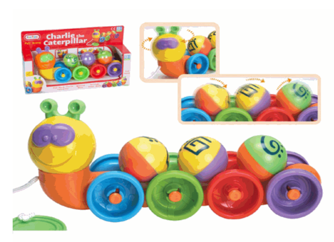
Suitable for ages 12 months & up Packaged size 30 x 18 x 8 cm