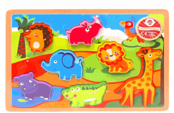
Suitable for ages 12 Months & up Packaged size 30 x 22 x 2 cm