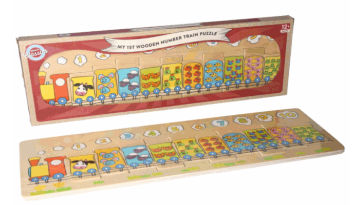
Packaged size 44 x 15 x 1 cm Suitable for ages 12 Months & up