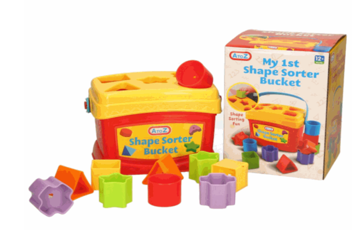
Packaged size 20 x 14 x 13 cm Suitable for ages 12 Months & up