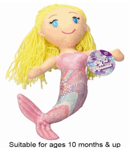
Suitable for ages 10 months & up Packaged size 16 x 23 x 5 cm