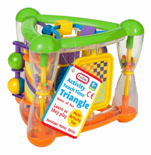
Suitable for ages 9 months & up Packaged size 19 x 18 x 20cm