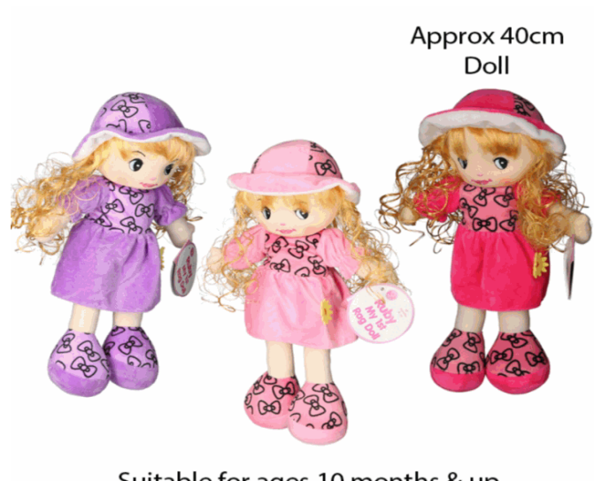
Suitable for ages 10 months & up Packaged size 25 x 40 x 9cm