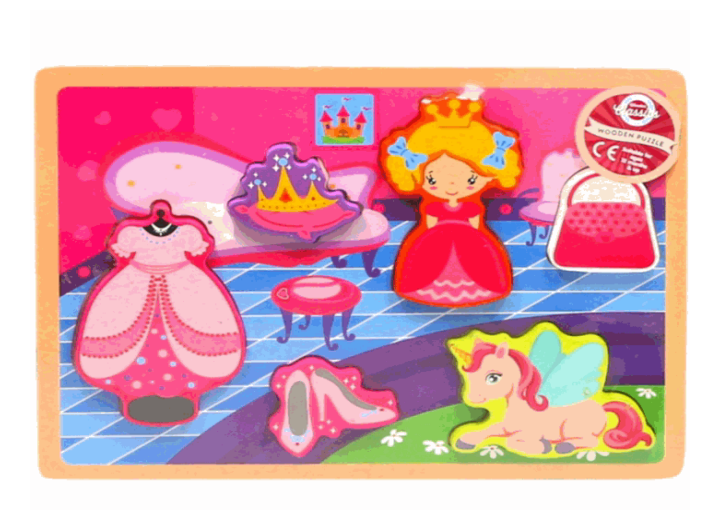
Suitable for ages 12 Months & up Packaged size 30 x 22 x 2 cm