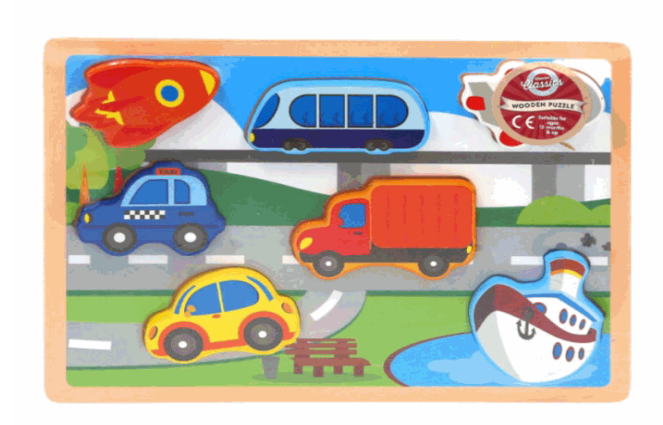
Suitable for ages 12 months & up Packaged size 30 x 22 x 2 cm