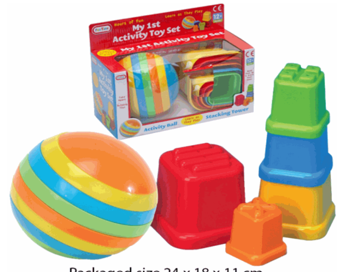
Packaged size 24 x 18 x 11 cm Suitable for ages 12 Months & up