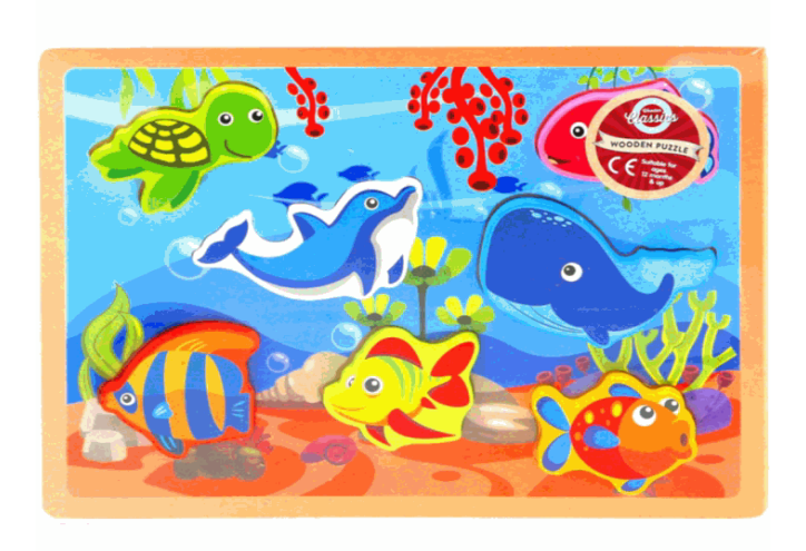
Suitable for ages 12 months & up Packaged size 30 x 22 x 2 cm