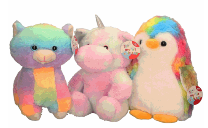
Packaged size 23 x 28 x 13 cm Suitable for ages 10 Months & up