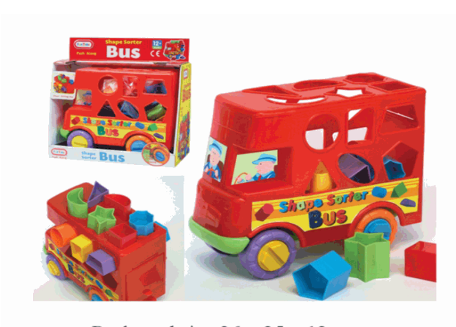
Packaged size 26 x 25 x 12 cm Suitable for ages 12 months & up