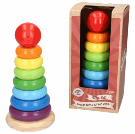
Packaged size 10 x 21 x 10 cm Suitable for ages 12 Months & up